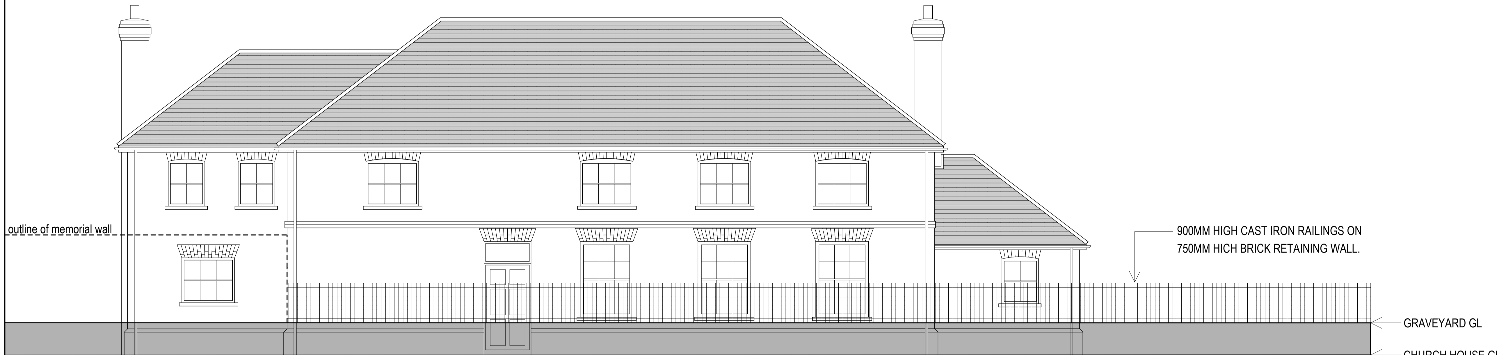
ELEVATION TO CHURCH AND GRAVEYARD