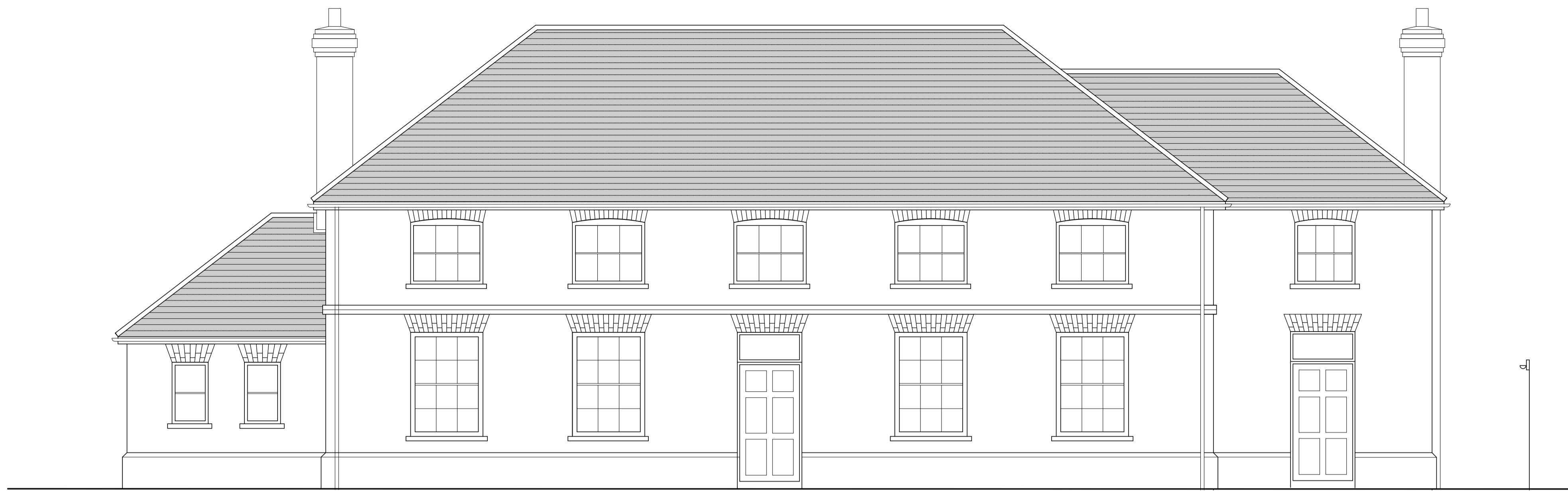
ELEVATION TO HADLEY COMMON AND GARDEN