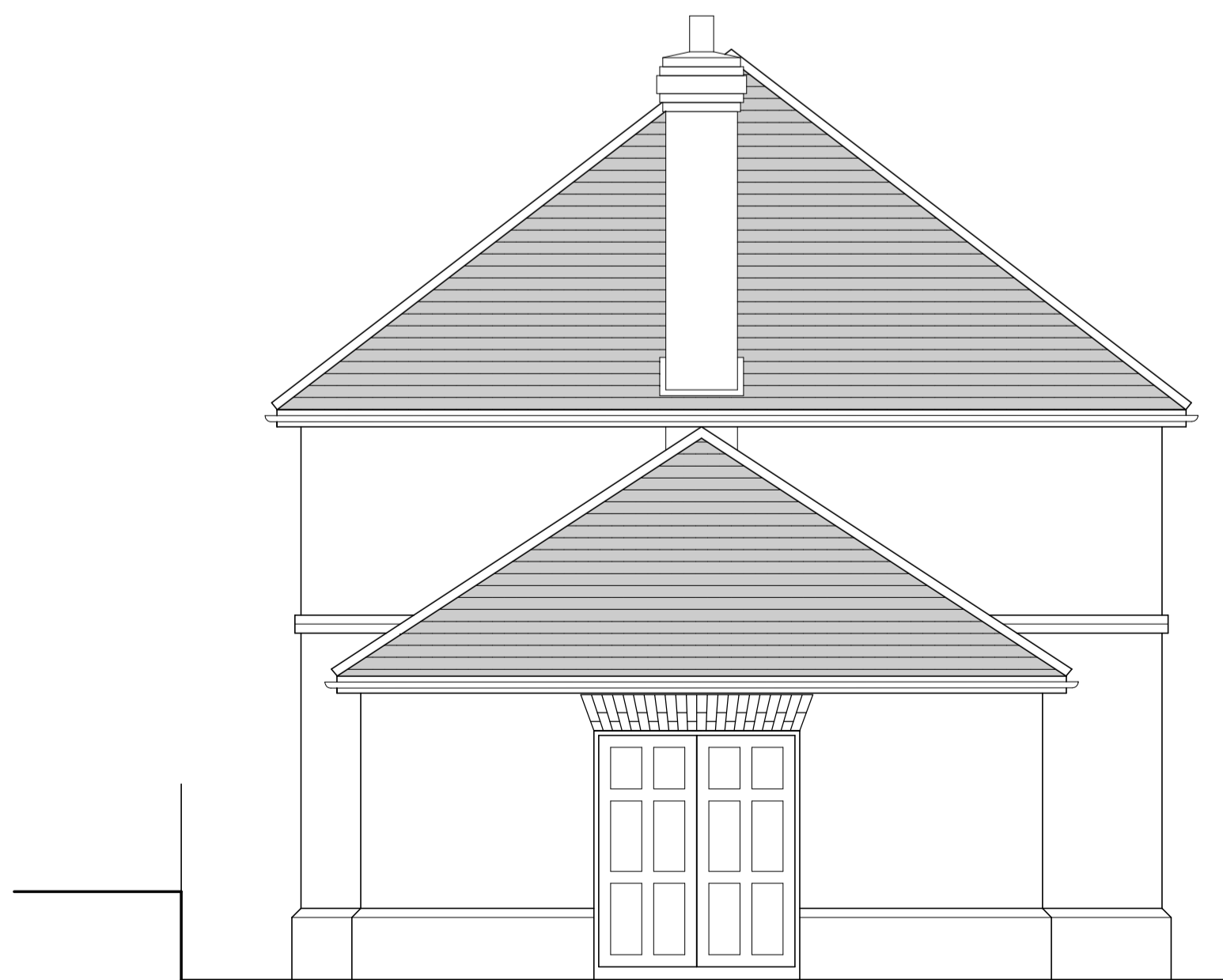
FRONT ELEVATION TO CAMLET WAY